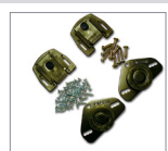
1 Door Fittings Kit (C1)

View our full range of accessories on page 136