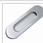
Oval Flush Pull (144S) satin, also available in black