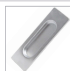
Rectangle Flush Pull (125/S) satin, also available in chrome