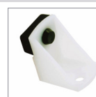
Door Stop (28P)