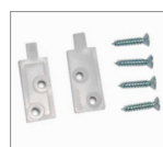
Guide (113/81X) for 81X channel, 2 per door