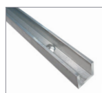
Guide Channel (81X/****) when a floor mounted guide is required