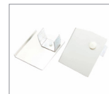
Fascia End Cap Pack (F134/ECP) for F134 fascia