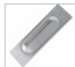
Rectangle Flush Pull (125/S) satin, also available in chrome