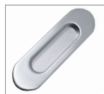
Oval Flush Pull (144S) satin, also available in black