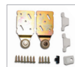
1 Door Fittings Kit (ST01)

View our full range of accessories on page 136